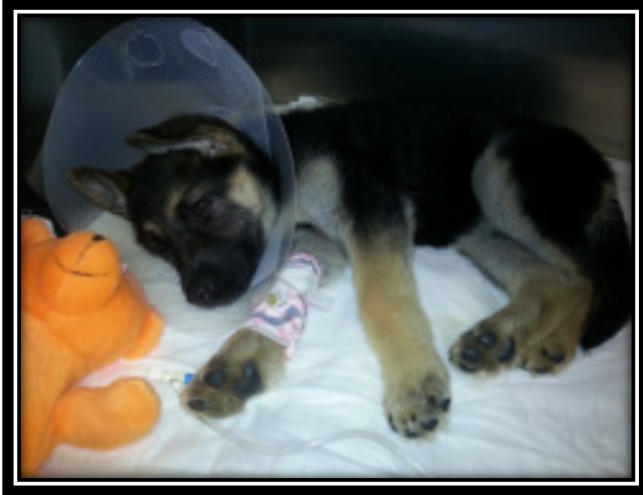
Kelsa was very ill.